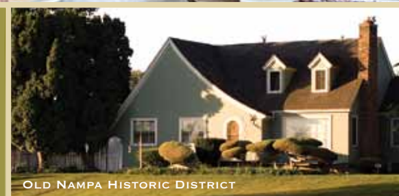
OLD NAMPA HISTORIC DISTRICT