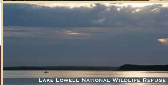
LAKE LOWELL NATIONAL WILDLIFE REFUGE