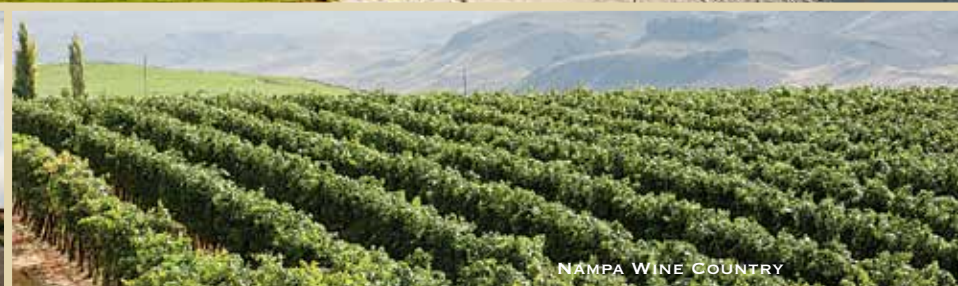
NAMPA WINE COUNTRY