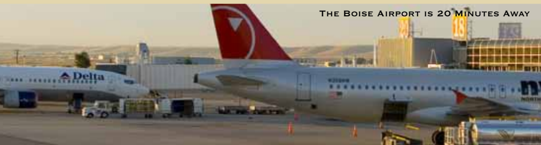
THE BOISE AIRPORT IS 20 MINUTES AWAY