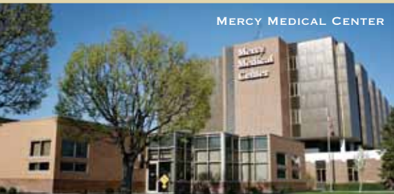
MERCY MEDICAL CENTER

“Our company has experienced unprecedented growth during the past three years. We needed to expand our plant and office space. The pre-existing building, support of the city, and the convenient location for employees made the decision to relocate to Nampa easy.”