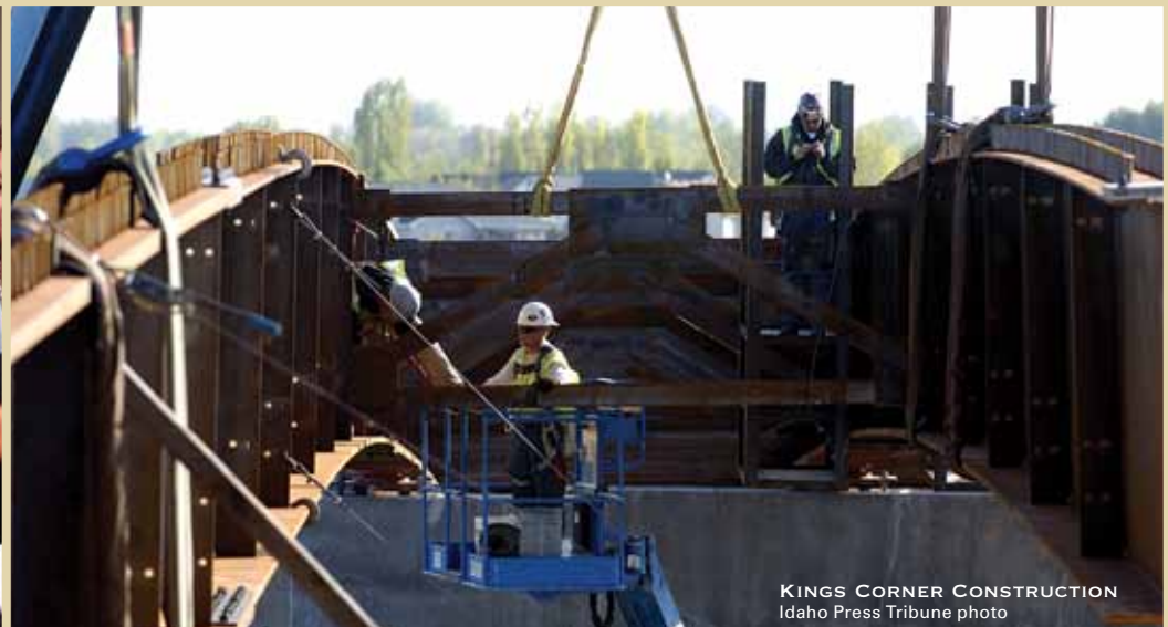
KINGS CORNER CONSTRUCTION