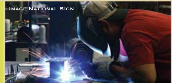
IMAGE NATIONAL SIGN