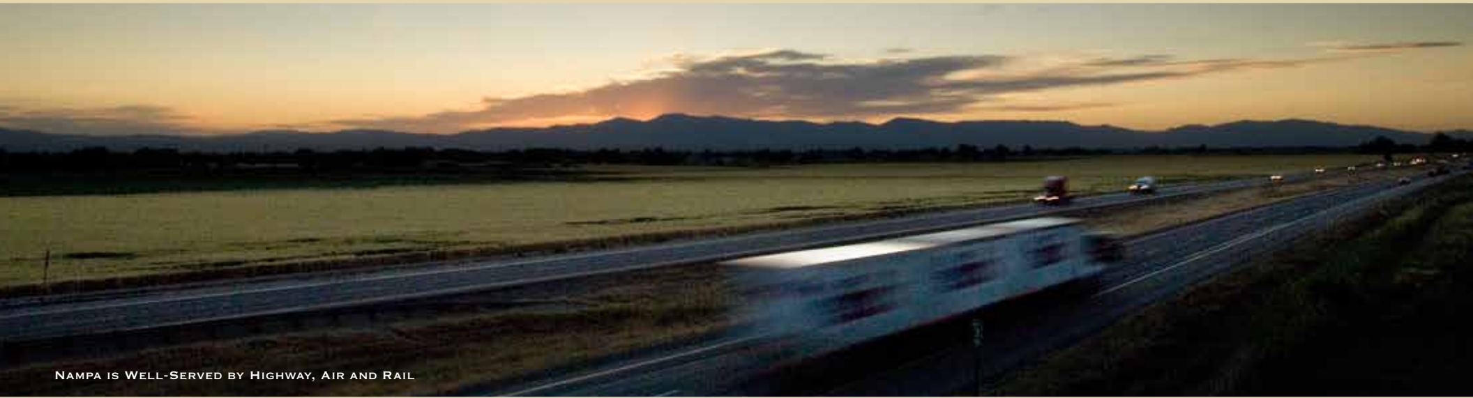
NAMPA IS WELL-SERVED BY HIGHWAY, AIR AND RAIL