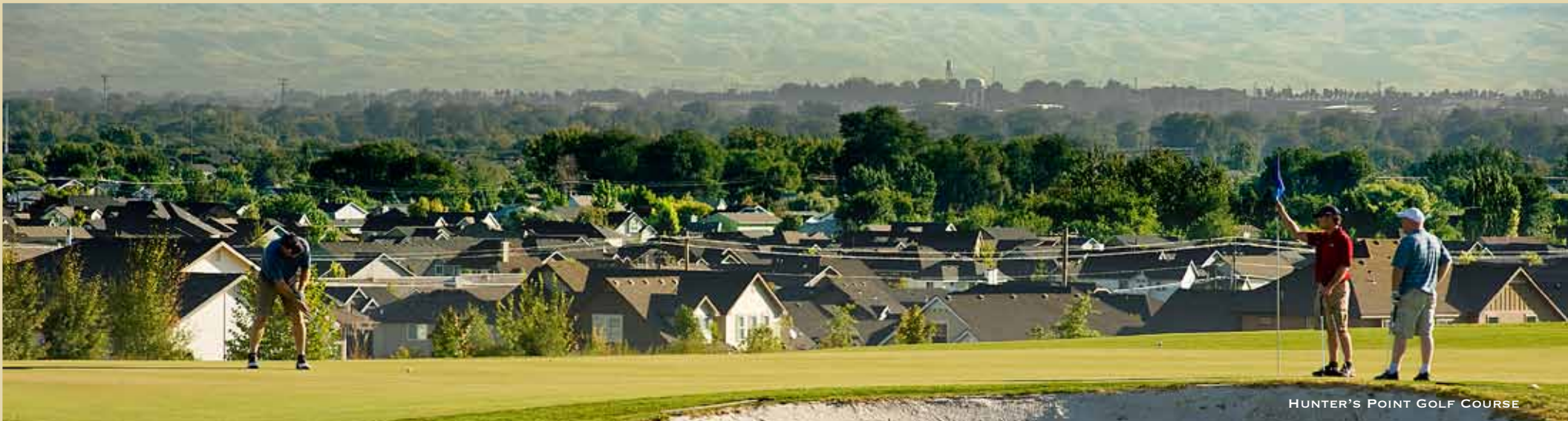
HUNTER'S POINT GOLF COURSE