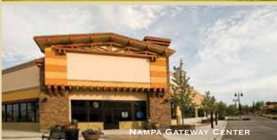
NAMPA GATEWAY CENTER