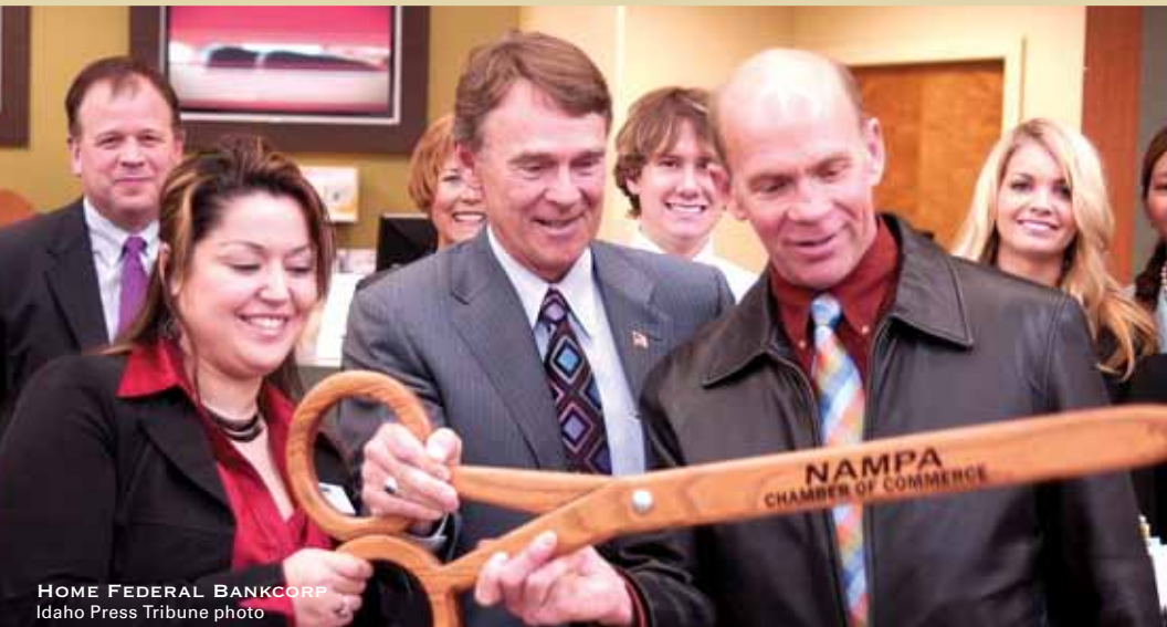
HOME FEDERAL BANKCORP